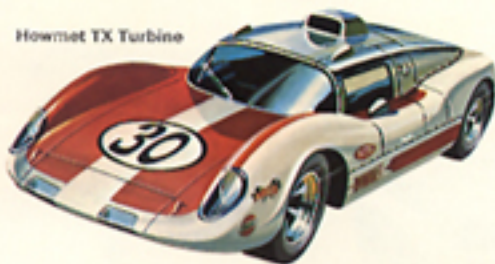
Howmet TX Turbine